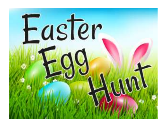
Trinity's Annual Easter Egg Hunt is scheduled for Saturday, April 1, at 2:00 p.m.

Also, if you have any Easter decorations you could donate, they would be greatly appreciated!