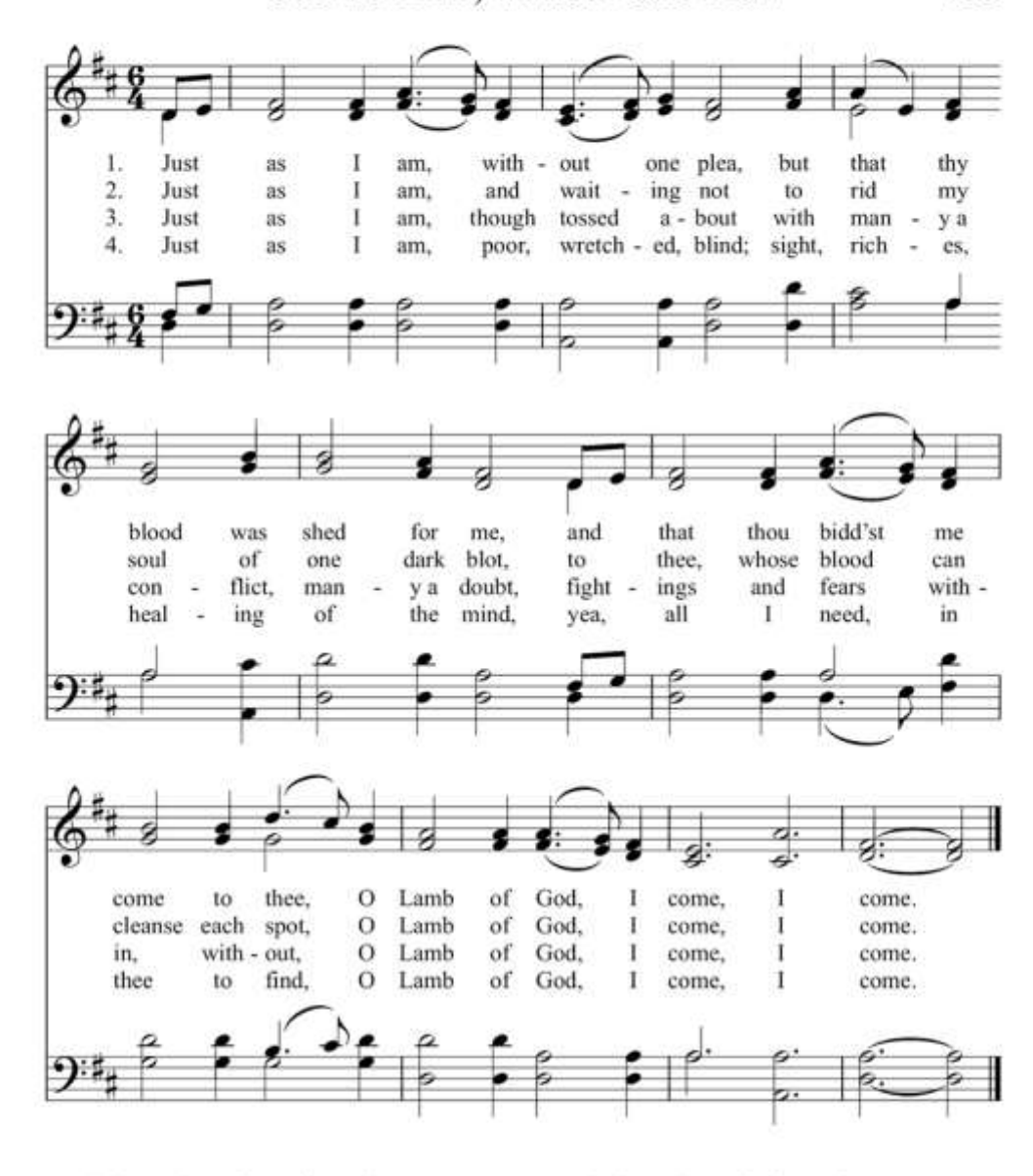
Just as I Am, without One Plea

Just as I am, thou wilt receive, wilt welcome, pardon, cleanse, relieve; because thy promise I believe, O Lamb of God, I come, I come.