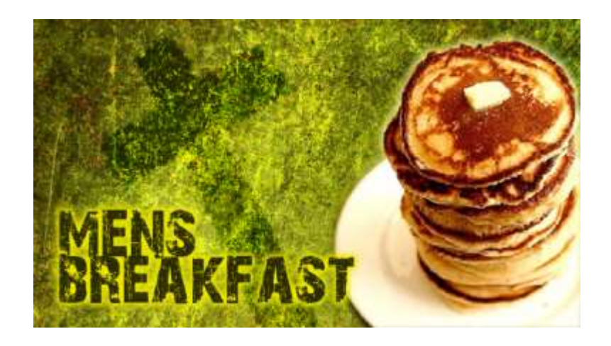
Saturday, September 28, 2019 7:30–9:00 a.m.

Men of all ages (bring your sons!) are invited to come and enjoy Jerry Pender's famous pancakes at our Men's Breakfast in the Fellowship Hall, Saturday September 28, 2019 from 7:30 a.m. – 9:00 a.m.