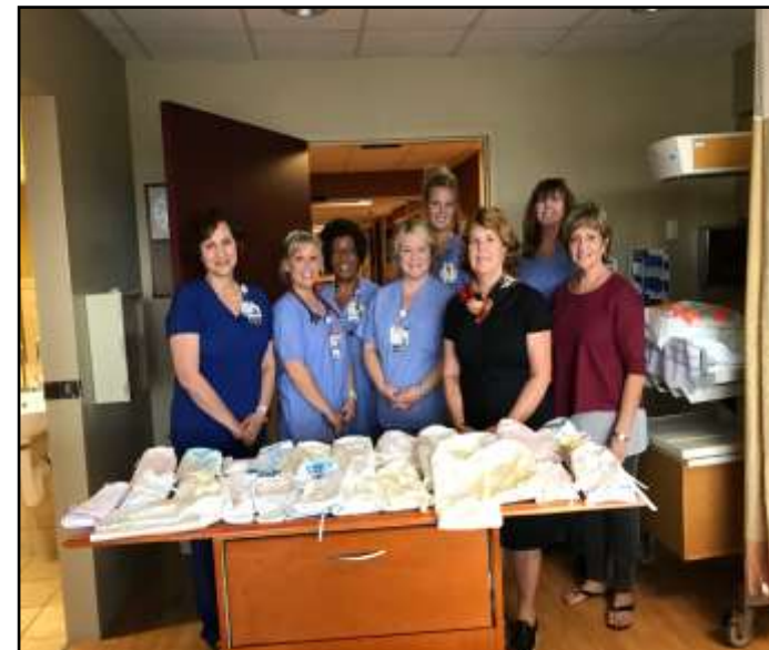
Labor and Delivery nurses at Clark Memorial Health stand behind a display of cocoons donated by Trinity.