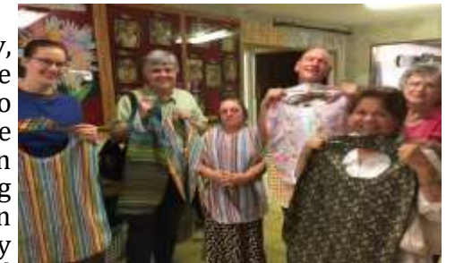
Members of the Sew 'n Sews and residents of the Blessing House display the new bibs, made of absorbent terry cloth and lined with cotton. The bibs cover chest, lap and upper legs when seated for meals.