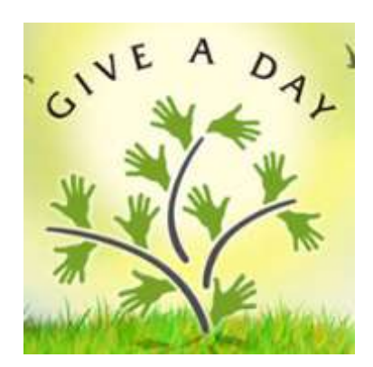
Louisville, KY APRIL 16 -24, 2016

Trinity will be partnering with the Presbyterian Disaster Relief Project during Louisville's Week of Service April 16-24, 2016. We are collecting items for Emergency Hygiene Kits