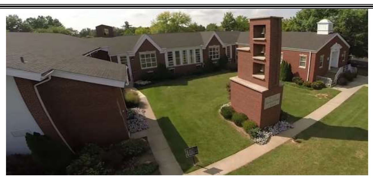
Trinity's Vision Statement "We are a welcoming church family, developing disciples who joyfully minister to others in the name of Christ."

Trinity Presbyterian Church 10200 Shelbyville Road Louisville, KY 40223